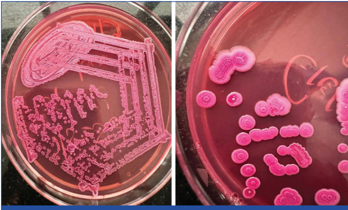
[Table/Fig-3]: Day 4 growth of Burkholderia pseudomallei colonies on a MacConkey agar plate. [Table/Fig-4]: Dry, wrinkled, rough colonies with cauliflower head appearance as seen on Day 7 of incubation. (Images from left to right)

that the organism was suspected to be Burkholderia species. Further confirmation through Matrix Associated Laser Desorption Ionisation-Time OF Flight (MALDI-TOF) and PCR-based DNA sequencing targeting the 16S rRNA region identified it as Burkholderia pseudomallei (Accession number: OR271924).