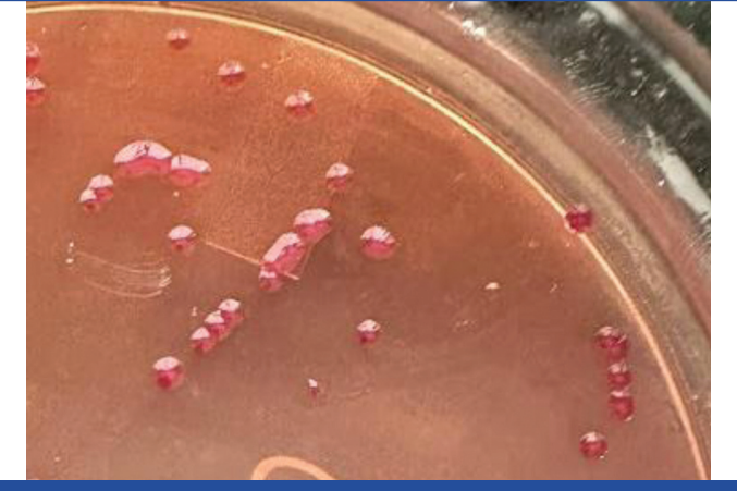
[Table/Fig-2]: Day 2 growth of Burkholderia pseudomallei non lactose fermenting colonies with pinkish hue seen on MacConkey agar plate.

The isolated organism displayed non lactose fermenting moist colonies [Table/Fig-2] on MacConkey agar plates and progressed to dry, wrinkled rough colonies with a cauliflower head appearance by day 7 of incubation at 37°C [Table/Fig-3,4]. It was oxidase positive, capable of hydrolysing bile esculin, reduced nitrate to nitrite, and resistant to Polymyxin B (50 units). Conventional methods indicated